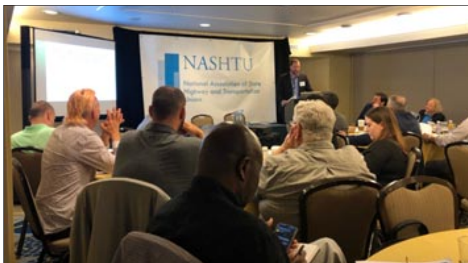
ABOVE: The NASHTU conference kicked off in DC on May 17th.