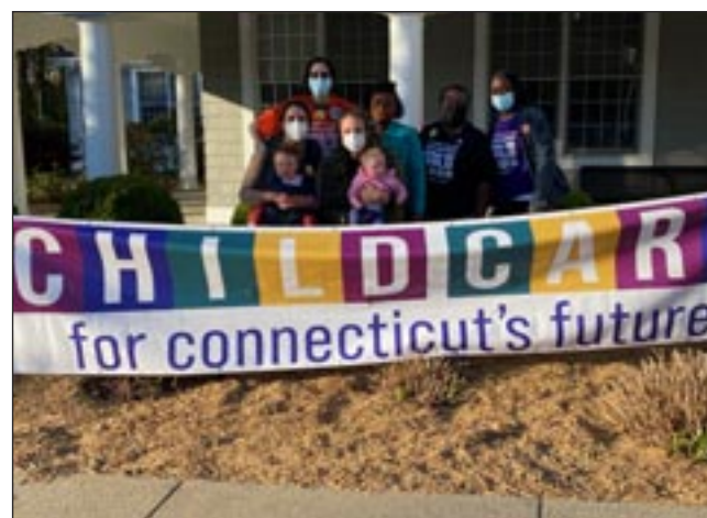
Child care providers, parents, and advocates from across the country joined together to call for funding to address the child care crisis.