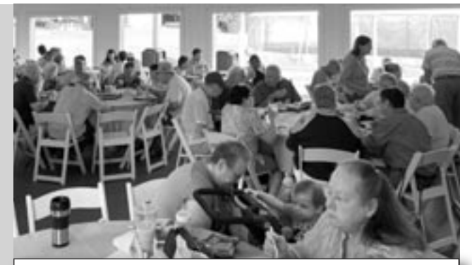
ABOVE: Attendees of all ages enjoyed the buffet and activities at the annual picnic!