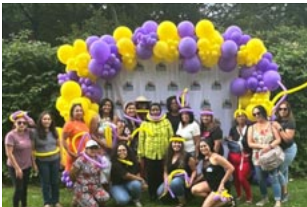
ABOVE: Members celebrated their #UnionWin with a picnic and quality time together!

So while childcare providers take a moment to celebrate these monumental gains, it's critical that we look ahead and prepare for the fights coming up. We must stand together as proud union members and raise our collective voices to demand better - better wages, better benefits and a better future for Connecticut's children.