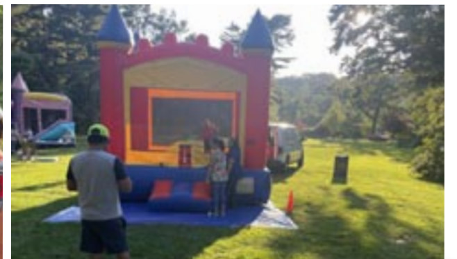
ABOVE: The picnic was a family-fun event complete with a bouncy house.

Childcare Providers gathered on a sunny August day to celebrate each other and the new childcare contract. Their partners and kids joined in on the festivities. Providers look forward to more in person events this com in year. If you are a provider and do not receive e-vites to events make sure to update your email info at: CSEA-CT.com